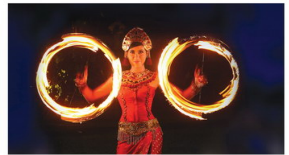
BEACH BBQ & FIRE DANCE Friday at Beach Garden

Be mesmerized by the exotic Balinese Legong Dance with a traditional buffet