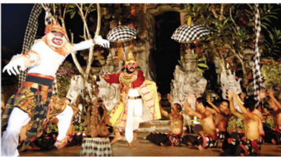
KECAK DINNER Monday at Budaya Cultural Theatre

Live Entertainment starting at 8.00pm on Monday, Wednesday and Friday