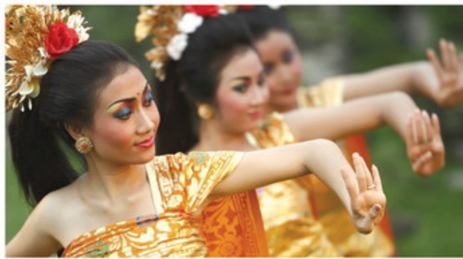
LEGONG DINNER Wednesday at Budaya Cultural Theatre

Sit back and enjoy the performance of a classical Balinese dance with a delicious Indonesian buffet menu.